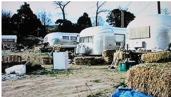
The Questa MCS trailer park. It has since closed.

We also see how people who do not have the financial means to build a healthy house have to cope. One owns a regular house she has improved on, but still has to sleep in a tent and a teepee out in the yard, despite the brutal winter. Another has lived in a van for a long time, though recently was able to rent a room from another woman with MCS. We also visit an MCS trailer park near Questa, New Mexico, that looks very depressing. The owner tells about all the suicides, but also the many people who have used the trailer park as a stepping stone to something better.