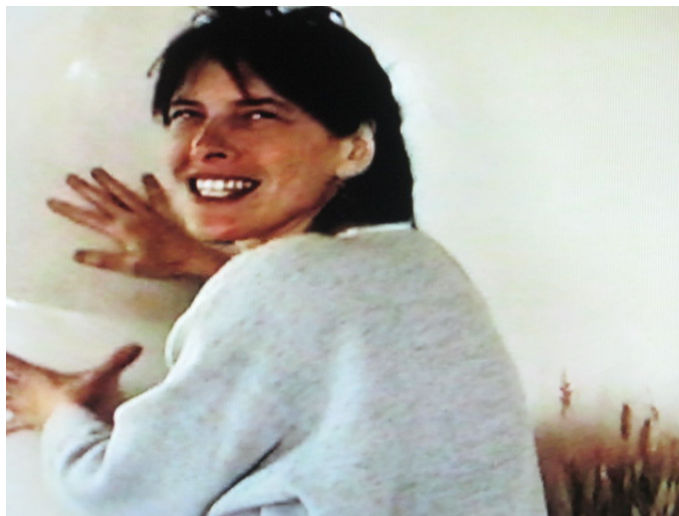
Abod feels so good with the plaster walls in the Baker-Laporte home.