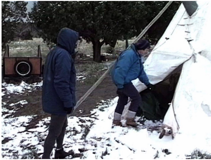
One woman can't afford a healthy house and sleeps in a teepee.

We also see how people who do not have the financial means to build a healthy house have to cope. One owns a regular house she has improved on, but still has to sleep in a tent and a teepee out in the yard, despite the brutal winter. Another has lived in a van for a long time, though recently was able to rent a room from another woman with MCS. We also visit an MCS trailer park near Questa, New Mexico, that looks very depressing. The owner tells about all the suicides, but also the many people who have used the trailer park as a stepping stone to something better.