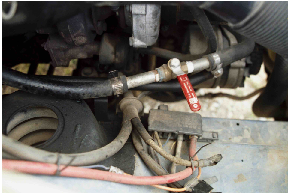
The modified junction box in a 300SD. The red handle is for a ball valve that was installed to replace the electric hot water valve (see later).

On the front right side of the engine is a little black plastic power distribution box (see picture). It is fed from the forward battery and has cables going to the fuse box and the starter. Locate the cable going from there to the fuse box and extend it to the second battery, which can conveniently be placed in the trunk. There is a handy port to bring the cable through the firewall, located right behind the battery. An AWG 6 size cable seems adequate for this long run, which never carries a high current. To bring the cable to the trunk, it can be routed through the speaker in the right rear side of the car, where there is access to the trunk beneath it.