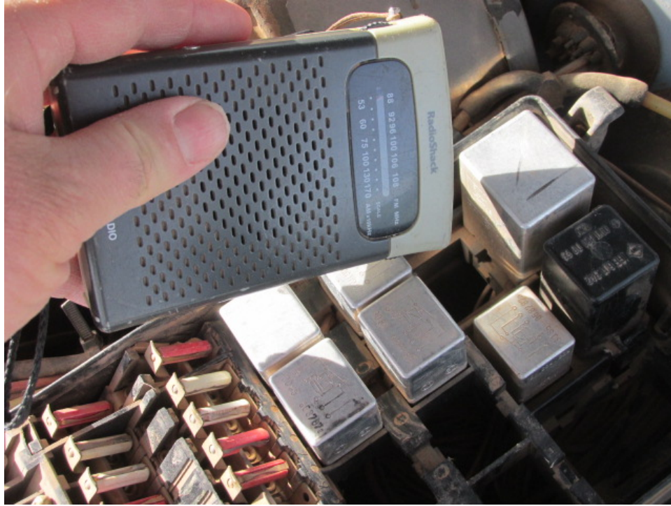
Using an AM radio to check the relays in the fuse box.

A gaussmeter can also be used, but it should be an analog model (such as the TriField meter). A digital gaussmeter may not pick up the brief bursts of radiation. The benefit of the gaussmeter is that it can be used with the engine running, as the noise is not a problem.