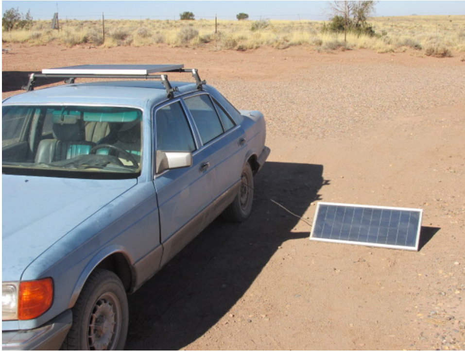
This car has a 40 watt thin-film panel on the roof and a 20 watt panel that normally sits in the rear window, but can be taken outside and placed so it faces the sun. This is useful for charging early and late in the day on long travel days.

In sunny Arizona, 40 watt solar panels work even in the winter. For climates further from the equator, or with more cloudy weather, higher wattage is needed.