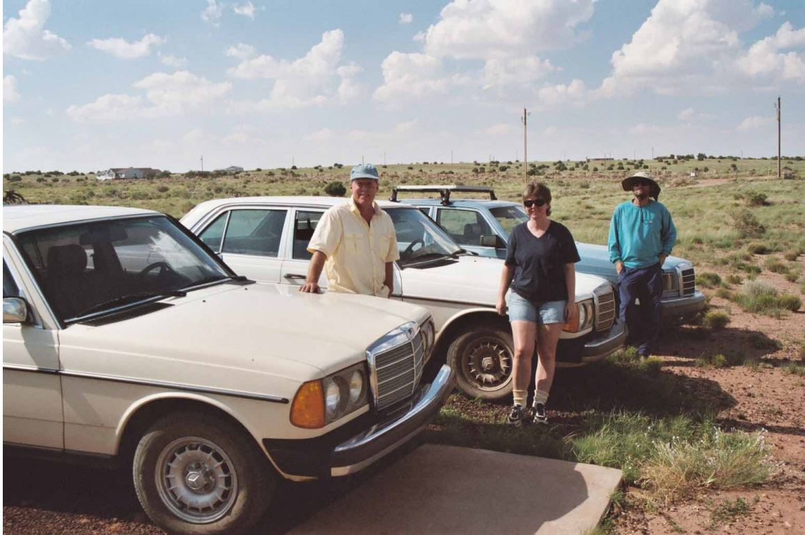
Three people with their modified Mercedes cars.

The unmodified Mercedes 300SD measures about 2 milligauss (200 nanotesla) around the driver. With the modifications, it measures about 0.2 milligauss (20 nanotesla). The 300D models are similar. None of these old diesel cars emit radio-frequency radiation.