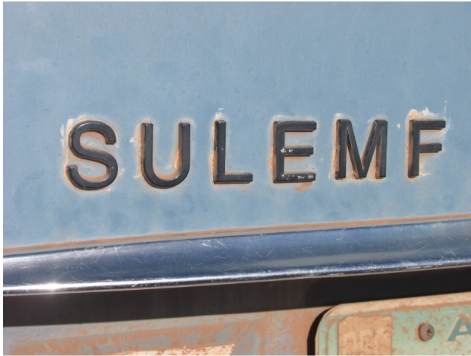
One owner of a modified Mercedes put this sign on the back. It is a spoof on the convoluted California car emission acronyms and stands for Super Ultra Low EMF.