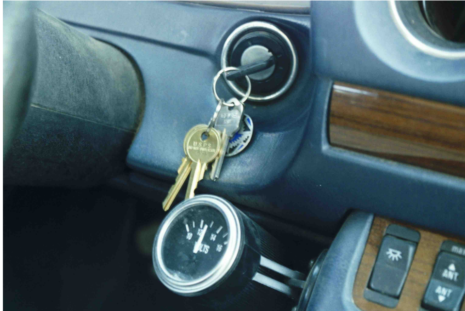
A volt meter is added so the driver can monitor the battery.