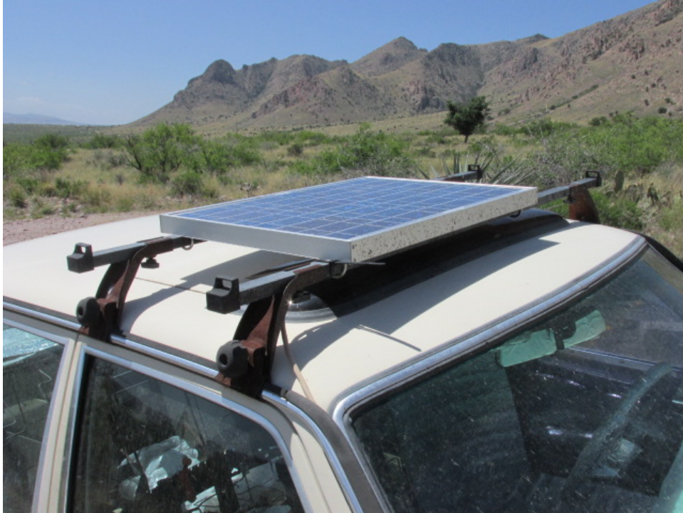
A 60 watt solar panel mounted on a roof rack.