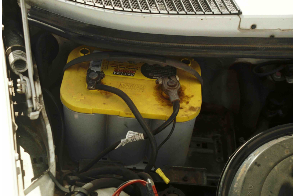
An Optima “yellow top” AGM battery powering a car without a solar panel. The battery is charged at home with a battery charger.

One alternator-less car uses a split battery system — one battery for starting the car, another for running it. This way, there will always be electricity left to start the car, even if the run-time battery had been depleted. This car has been used for long interstate travel.