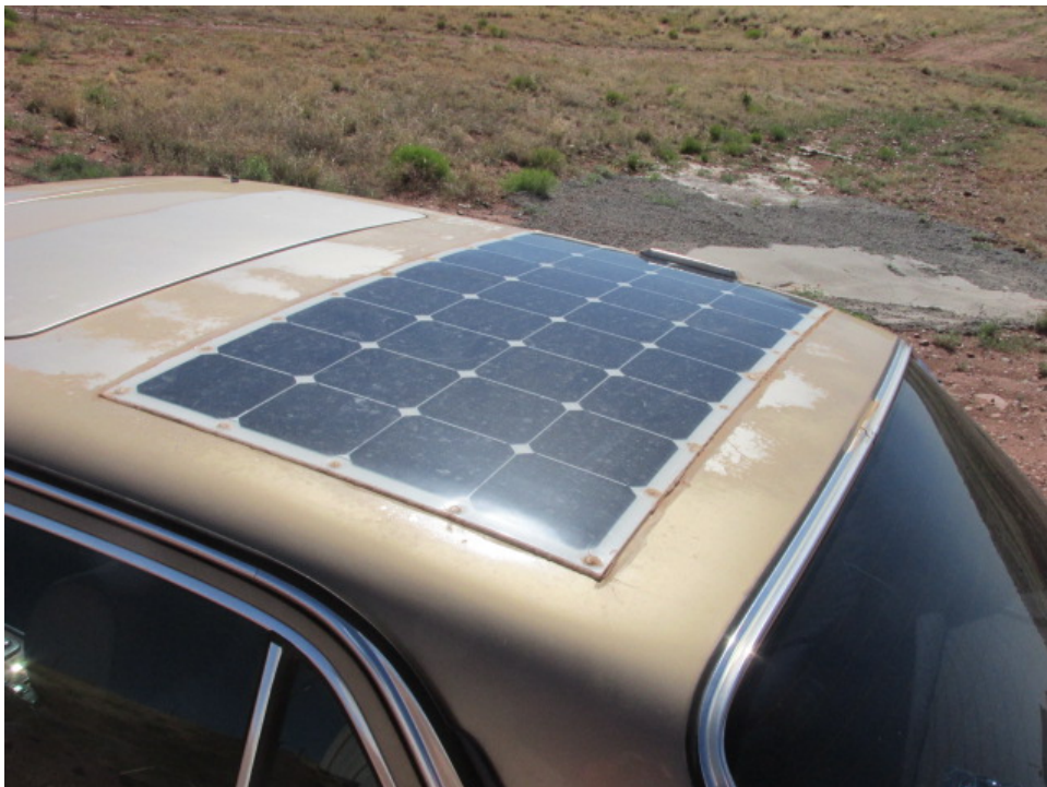
A 40 watt flexible thin-film panel mounted directly onto the roof.