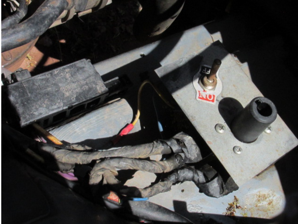
Two switches (right) mounted next to the engine in a 300SD. The wires were removed from the black plastic distributor box in the upper-left.

It is important not to engage the alternator with such a switch while the engine is running, as the resulting surge will eventually ruin the alternator.