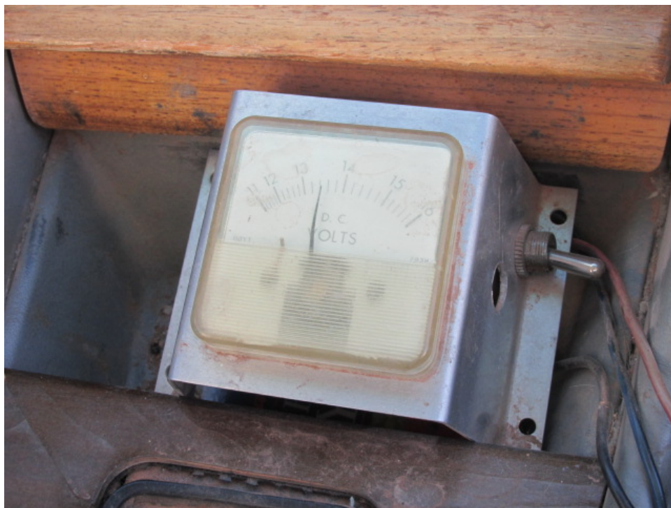
This volt meter has a switch to monitor two separate batteries in a split-system car (discussed below).

It is absolutely essential to have a voltmeter installed on the dash board, to monitor the condition of the battery system.