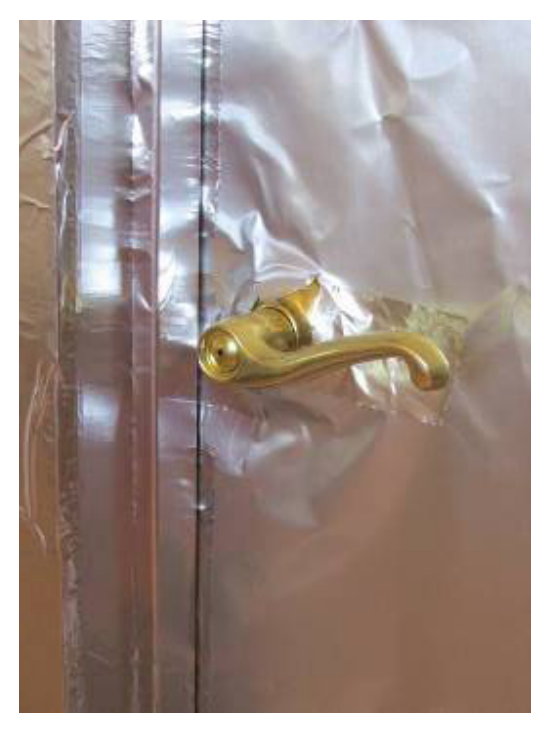
The shield must go snugly around the door handle. The door frame should also be shielded.