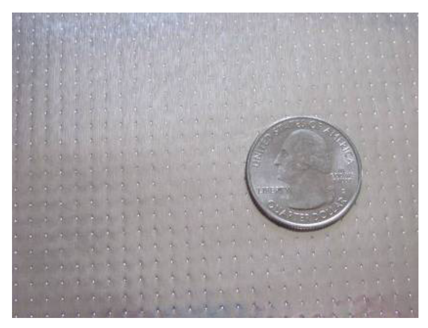
Perforated laminated aluminum foil. The tiny holes prevent mold by allowing the walls and ceiling to breathe.

If perforated foil is not available, the holes can be made manually using a roller with tiny spikes on it, such as the "woodpecker" tool.