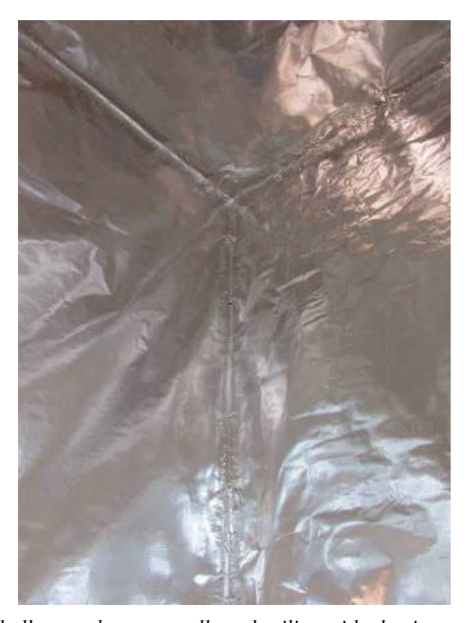
Seal all seams between walls and ceiling with aluminum tape.

If the fixture has a high-wattage light bulb, make sure it does not make the laminated foil so hot it damages or ignites the plastic or paper inside.