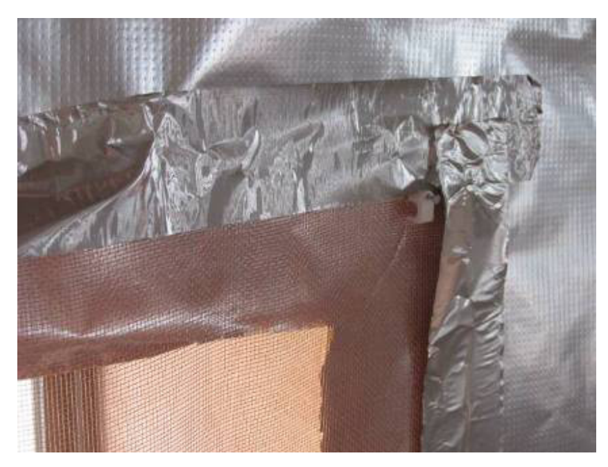
Copper mesh shields the window on the inside. The mesh is mounted onto the aluminum shielding using a couple of nails and lots of aluminum tape.

The copper should not be mounted outdoors, as the rain will make it corrode. Make sure the mesh is in contact with the foiled walls all the way around the window.