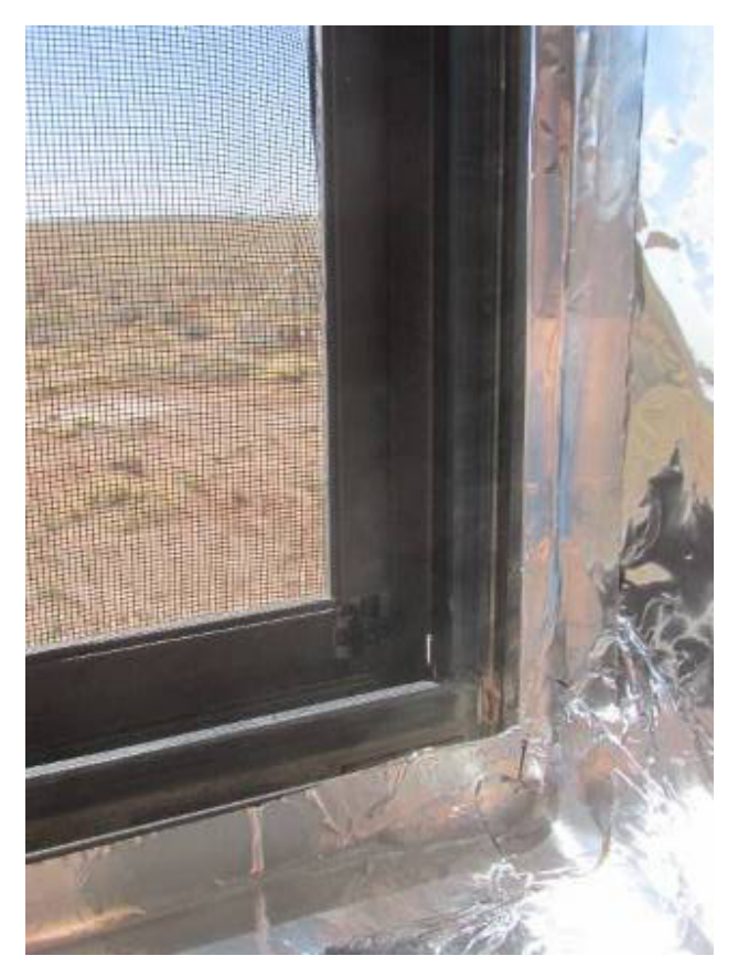
With low-E glass the window is already shielded, though foil must be installed to cover the frame, sill and the rest of the window hole. This window has an insect screen that does not provide any shielding.

If the window frame is of metal, then it does not need to be covered with the aluminum tape.