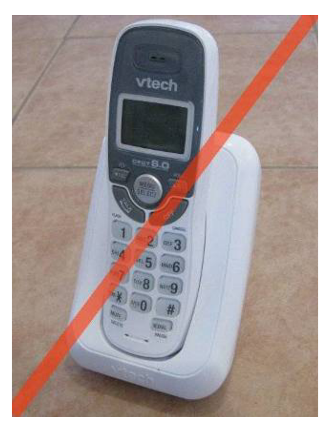
Do not attempt to use any wireless device inside a shielded room.

You can have a telephone in the room, but it MUST be corded. Do not attempt to use a cell phone or a cordless phone inside, as the microwaves from these phones will be trapped inside the room and expose you to much higher radiation levels. The same goes for all other wireless devices.