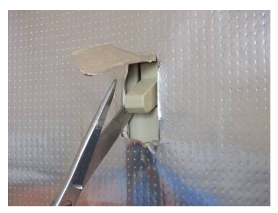
Cut around any wall switches.

It is fine to use several pieces of tape, as long as they overlap each other.