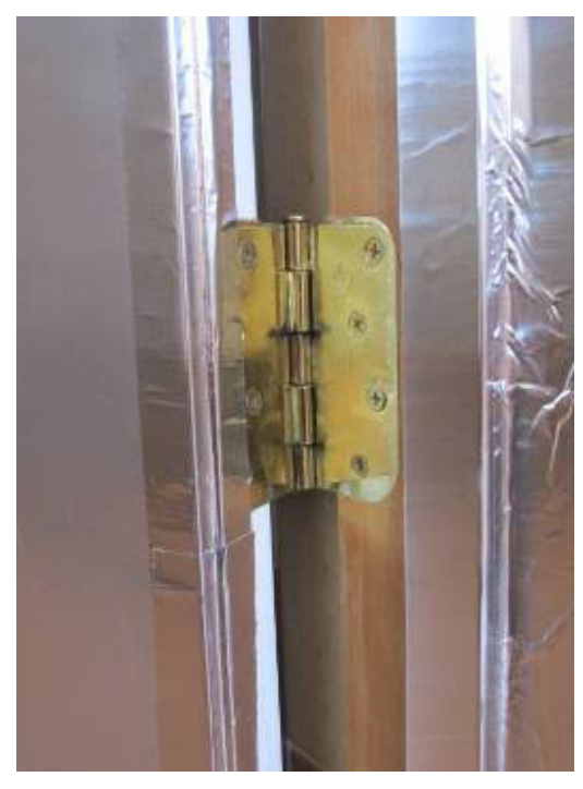
The foil is attached with aluminum tape all around the door edge. The room side of the frame is shielded with aluminum tape.