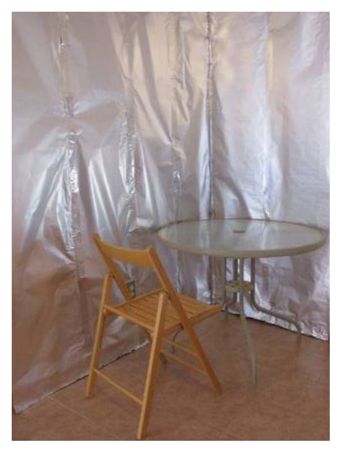
Room shielded with foil from a grocery store. The floor needed no shielding.

It may be necessary to perforate the foil manually to allow the walls and ceiling to breathe.