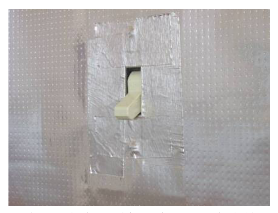
Then tape closely around the switch to maintain the shield.

If there are wall-mounted light fixtures or baseboard heaters, work around them so they poke through the foil. It may help to let some of the foil in between the fixture and the wall, but make sure the foil doesn't touch any of the wires.