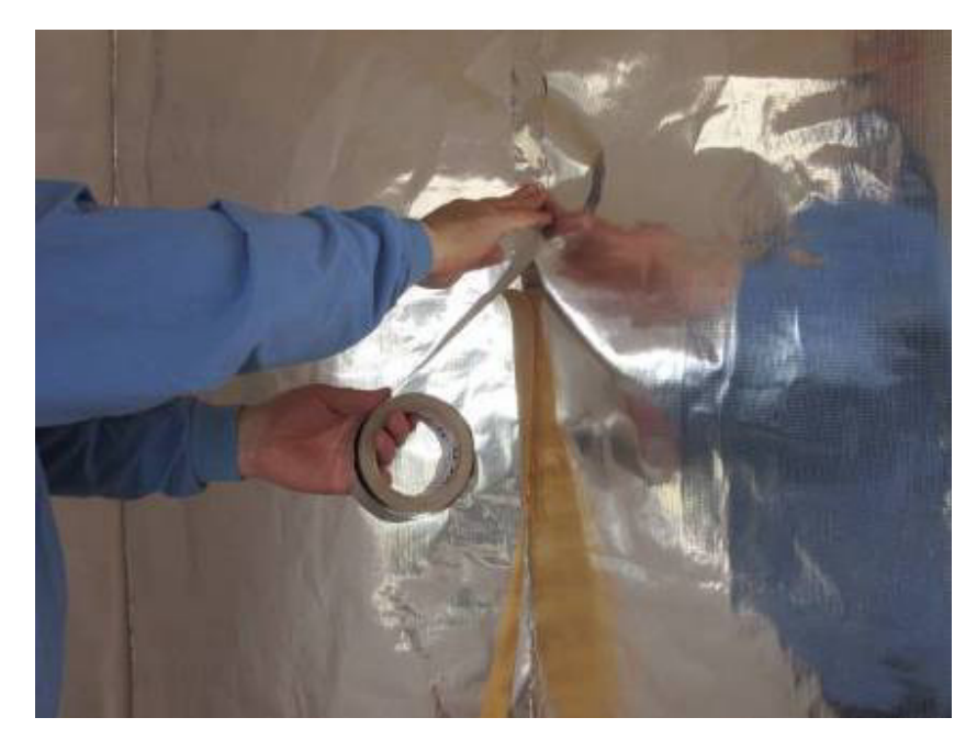
Taping the seam