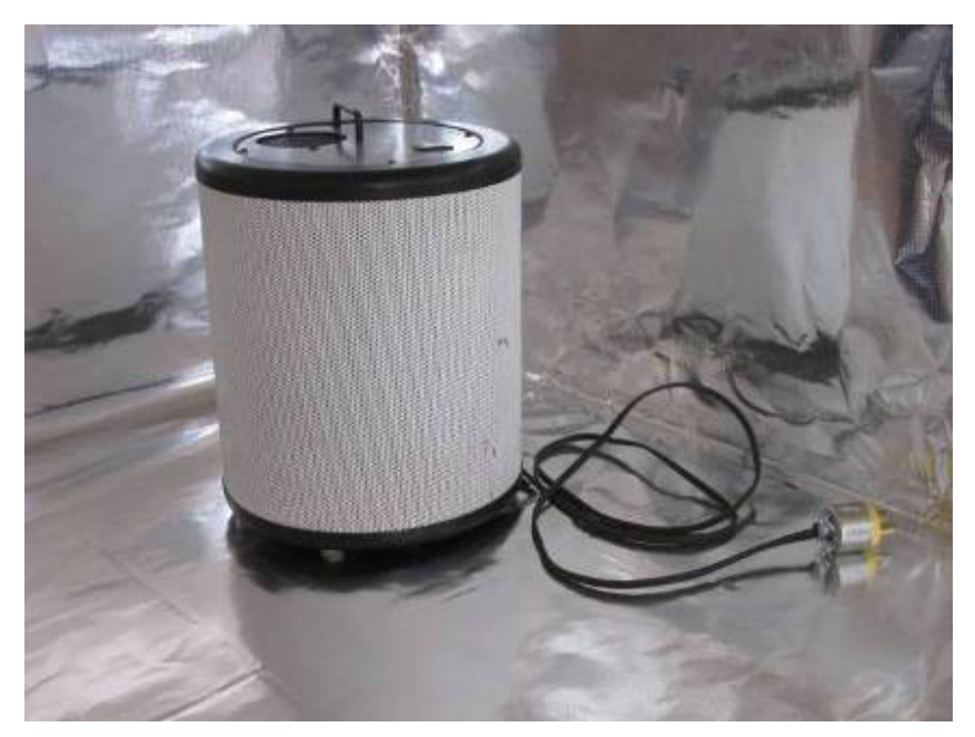
This simple method discourages the use of electrical equipment of any kind inside, both for health and safety. However, medical equipment may be allowed.

How to safely use electricity inside a metallic room depends on the specific situation and is beyond this simple how-to article. Try to make it work without electricity in the room — other than the ceiling light and a few other essentials, such as a smoke detector, a battery clock, a corded telephone and perhaps a battery powered radio (if it will work inside). Consider using a flashlight or battery powered camping lantern if necessary.