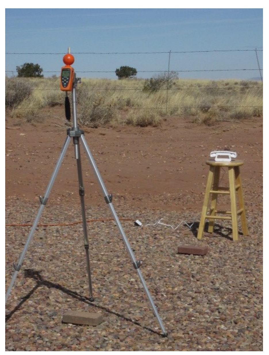
Measuring the Swissvoice ePure ECO DECT handset and base.