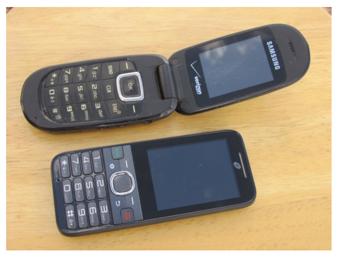
The two basic mobile phones we tested. Without any "smart" features, they were silent for at least 10 minutes at a time.

Mobile phones are designed differently than cordless phones. They are typically away from chargers for hours every day, so conserving the battery is important. They also use a set of base stations that are shared among many users, so it needs to limit congestion and be able to switch over to other base stations if they provide a stronger signal.