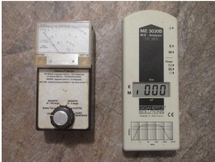
Two moderately priced gauss meters that are sufficient for most people's needs: Alpha Labs TriField (left) and Gigahertz Solutions ME 3030B (right).

In North America, a gauss meter measures the strength of the radiation in the unit milligauss. In other countries, microtesla is used (1 microtesla = 10 milligauss).