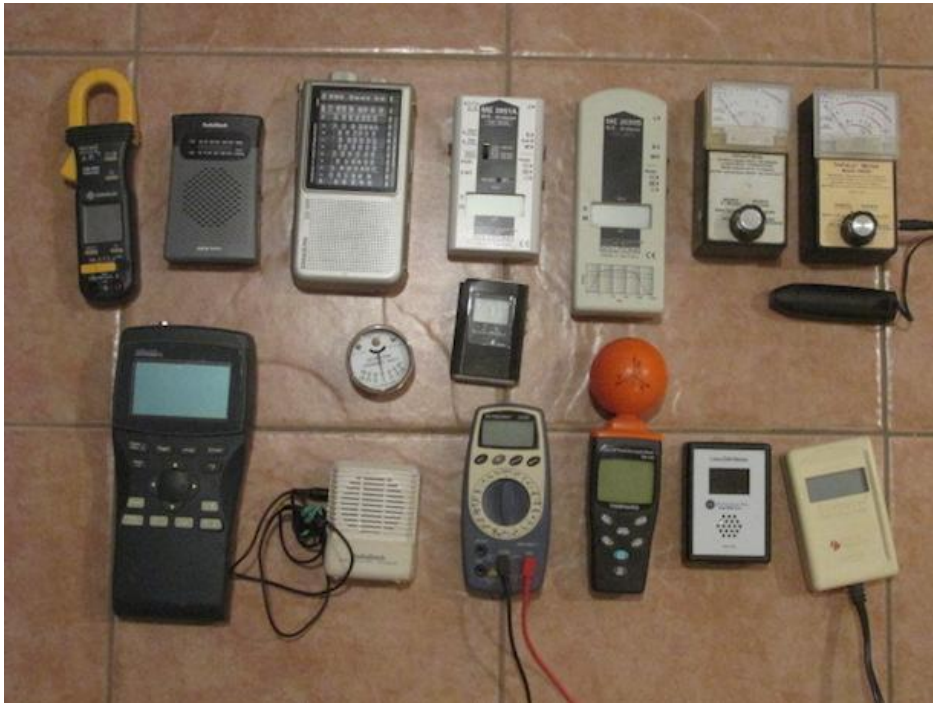
The author's arsenal of instruments, which still do not cover all possible situations.