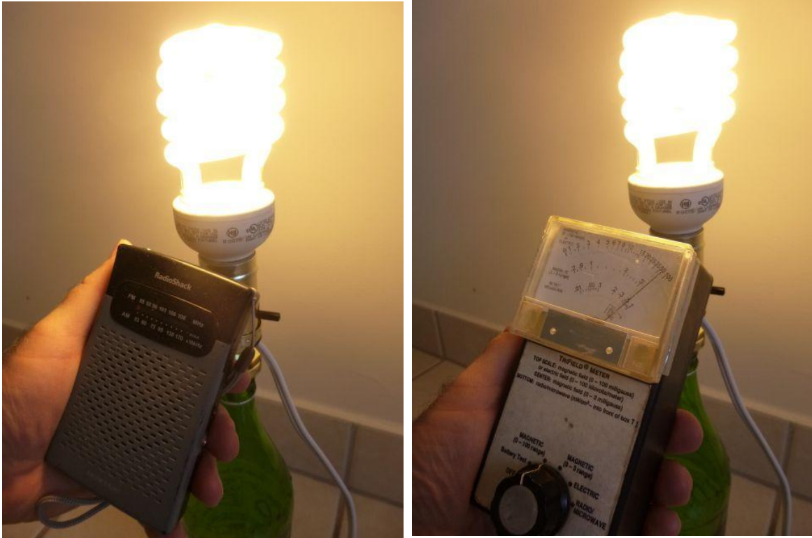
Measuring a compact-fluorescent light bulb with both an AM radio and a gaussmeter. The bulb emits a wide range of frequencies picked up by both instruments.