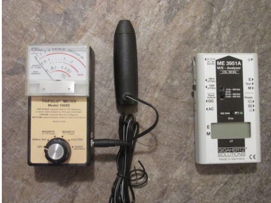
Two very sensitive gauss meters that can detect EMF down to 0.001 milligauss (0.1 nanotesla): Alpha Labs TriField 100XE with external probe (left) and Gigahertz Solutions ME 3951A

We like the Alpha Labs TriField 100XE and the Gigahertz Solutions ME 3951A. The TriField 100XE is all analog, but it is harder to use (see below) than the ME 3951A. The ME 3951A can also measure the electric field with a useful sensitivity.