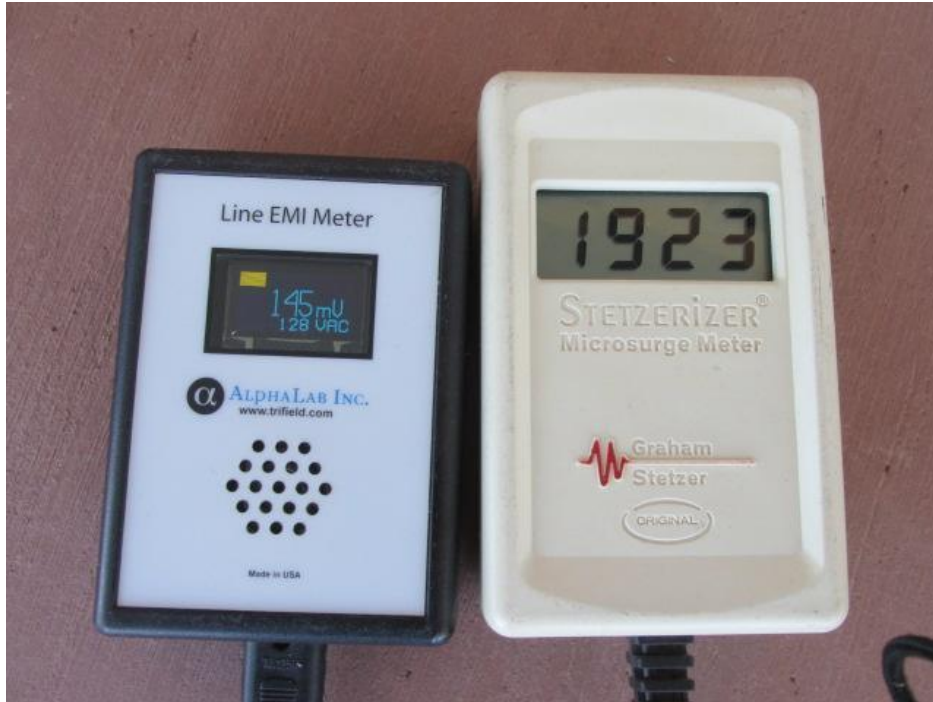
Two meters showing high levels of dirty electricity. They are from Alpha Labs (left) and Stetzer (right).

To find sources of dirty electricity, plug the meter into various outlets. The reading will be higher the closer it is to a source.