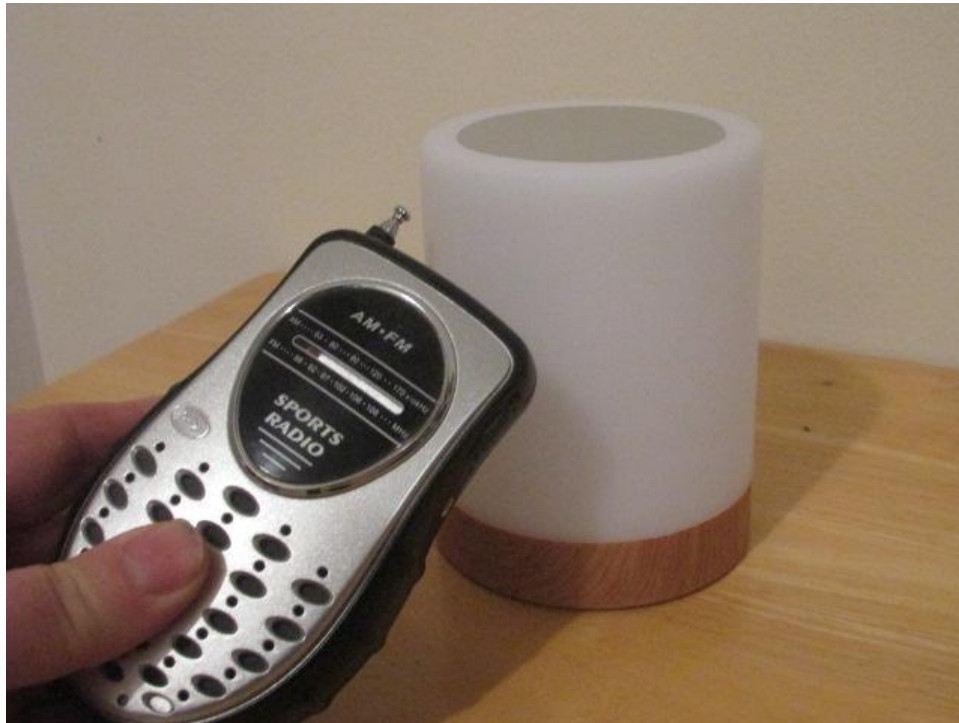
Checking a rechargeable night light that is controlled by touch. It radiates even when “off.”