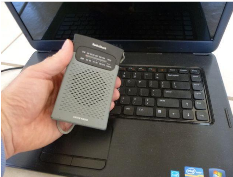
Any computer will generate a lot of static in an AM radio.