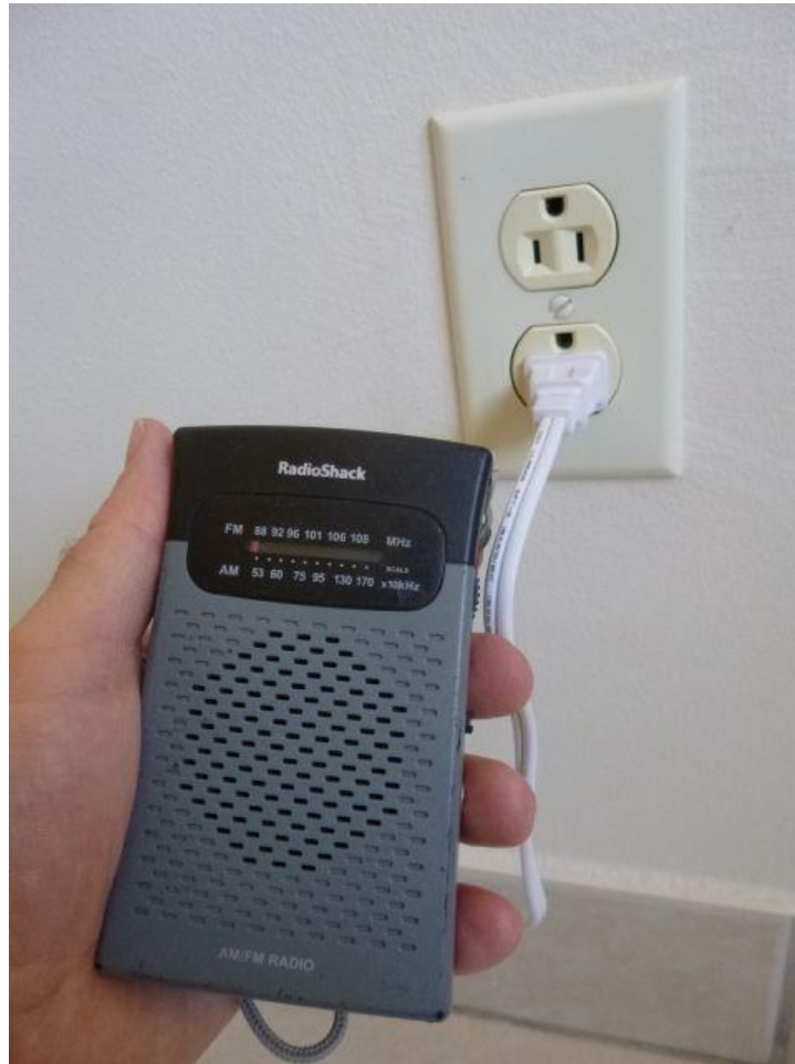
Measuring dirty electricity with an AM radio.

You can use the AM radio to detect dirty electricity by holding it up against electrical wires that are not near any electronic device. Try to open the breaker panel and hold it against the breakers, but not next to the electrical meter. Be aware that American houses built later than 2008 will have an AFCI breaker, which radiates and creates dirty electricity.