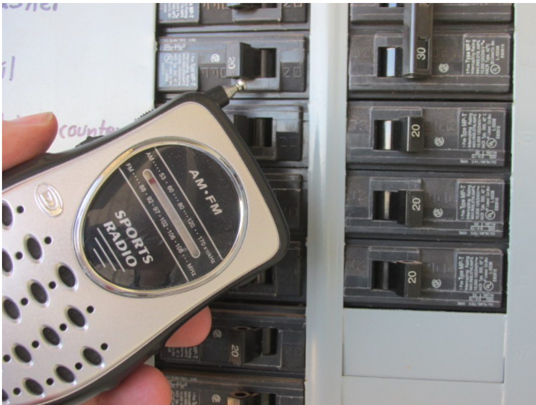
Detecting dirty electricity from the outside on the main breaker panel, with the breakers off.

Dirty electricity consists of unwanted frequencies, which travel on the electrical system, i.e. the power lines along the street, the household wiring and the ground currents. Most dirty electricity is frequencies in the kilohertz range, but dirty electricity can contain any frequency, from single digit hertz and up into the