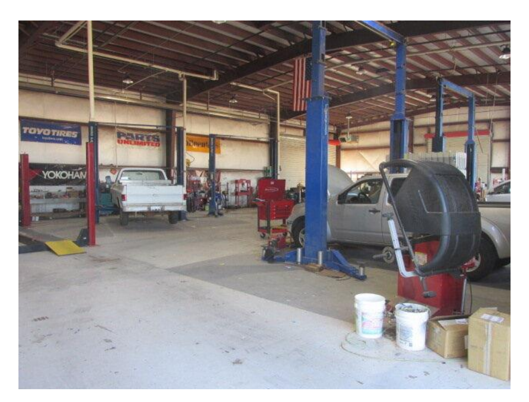
Some shops work on cars inside the building away from the entrance doors. That is best avoided, unless it's a really clean shop.

But there are also shops that have just one entrance door into a large room with lots of work bays. These are best avoided, unless it's a really clean shop.