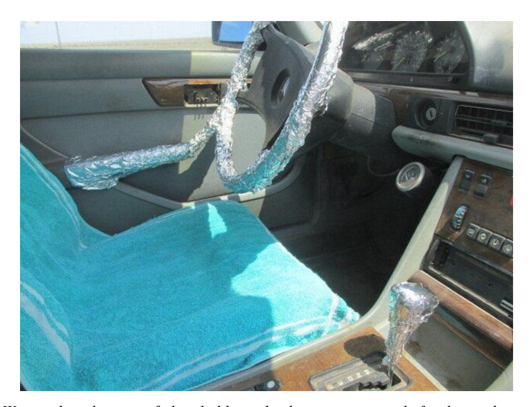
Wrapped in aluminum foil and old towels, the interior is ready for the mechanic.

You can hold these in place using tape, rubber bands, bungee cords, or similar. Or they may stay on their own.